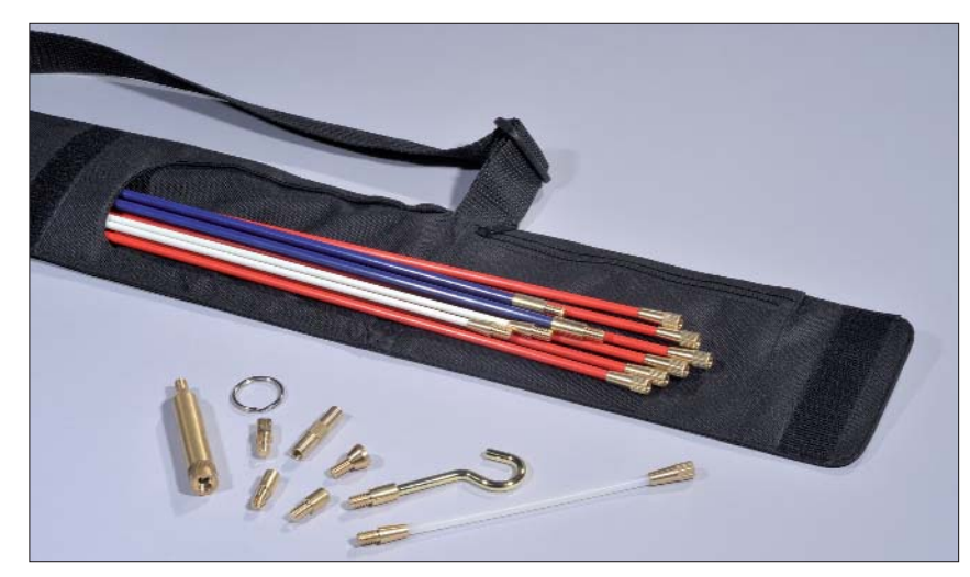
All components stored neat and tidy with our rod set.

Our cable installation system is a professional tool which enables jobs to be done in record time even in the most challenging environments. Rods made of glass reinforced plastic (GRP) are able to pull a cable weight of up to 80 kg. The product also allows its user to inspect, illuminate and retrieve. The complete system integrates rods, a variety of useful attachments and a bag to store all parts in one place.