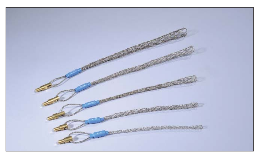
Cable Grips are available in five different sizes to attach a wide range of cable diameters.

Cable Grips are designed to grip objects from the outside and provide a very reliable super fast method for securing pipes and cables to the rods. Just open a grip by compressing the braided sleeving, push it over a cable and let go, the material will contract immediately and establish a tight fastening of the cable to the tool.