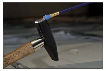
The strong magnet lifts a metallic tool of up to 2.5 kg.