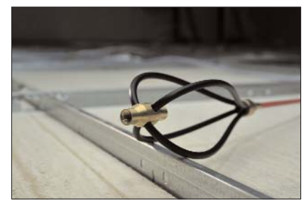
The whisk allows the rod to glide over obstructions easily