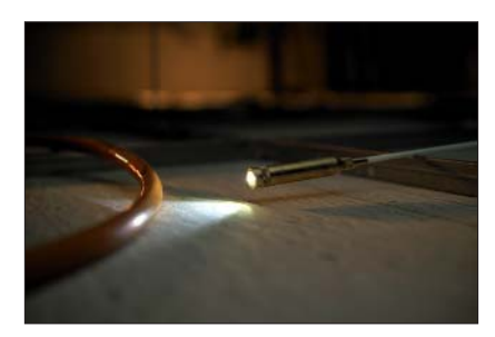
The beam – a perfect tool for seeing into cavities.

Due to the wide range of innovative accessories and different flexibilities our cable installation system is perfectly suited for many different applications.