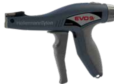
EVO 9i – 110-88001