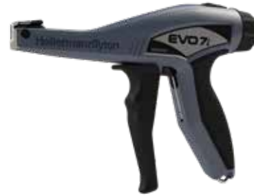
EVO 7i – 110-77001