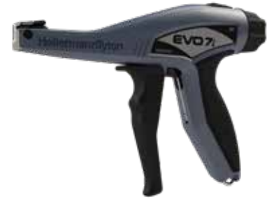
EVO 7i SP – 110-77002