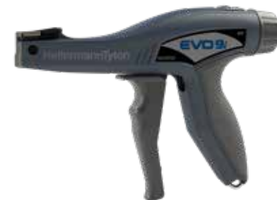
EVO 9i HT – 110-88003