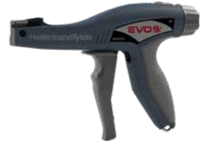
EVO 9i SP – 110-88002